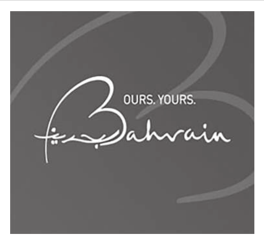
Fig. 1.1 for Question 1

The Bahrain Tourism and Exhibitions Authority (BTEA) promoted the Kingdom of Bahrain as a leading tourist destination during a roadshow held in the UK in May 2018. The promotion was led by BTEA officials and included representatives from a local airline company, a number of hotels and travel agents.